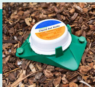
Ant bait station

Pick up some ant bait stations today from your normal pest control product supplier.